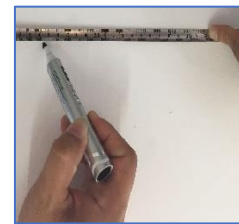
Mark the centre dimensions on the wall