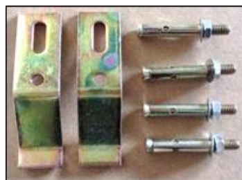
Remove nut and washer from fixings