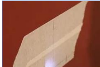
Mask the wall where the installation is to be carried out, to protect the wall finish