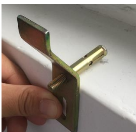
Place the bracket over the thread