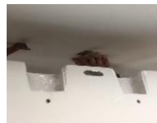
Hang the basin onto the brackets, silicone or adhesive can be used in conjunction with the fixings