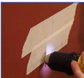
Drill wall to a depth of 12mm