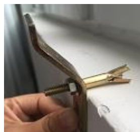
Fit the washer and nut and tighten until secure