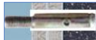
Insert the fitting into wall, leaving the thread exposed by 8 - 10mm