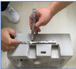
Measure the centre dimension between the slots on the basin